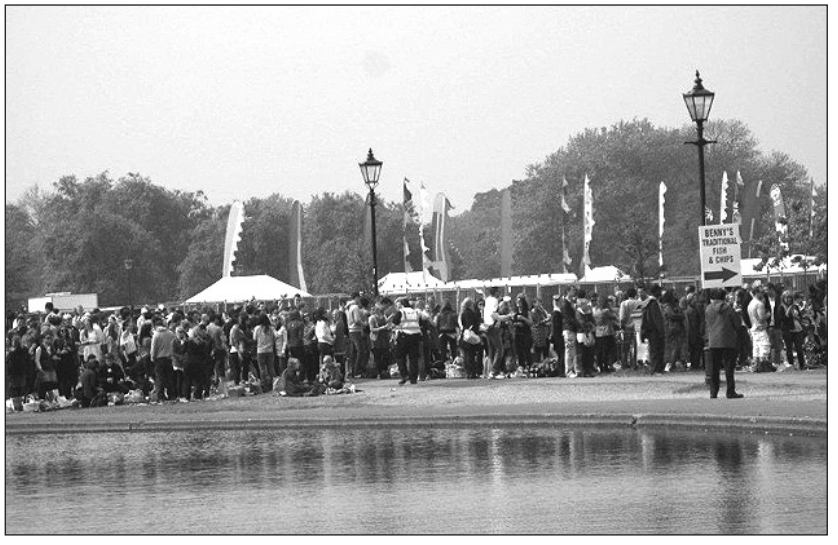
A good crowd.... outside

This event, which comprised a camp site, a showing of the Royal Wedding on a large screen, various entertainments and food and drink outlets, turned into a dismal flop. 1800 tents accommodating up to 4000 people were expected but we understand that only about 25 tents were used by campers. What was booked as a three-day event dwindled away on the Saturday. Scarcely any of the promised entertainments appeared and the few visitors were outnumbered by the security staff.